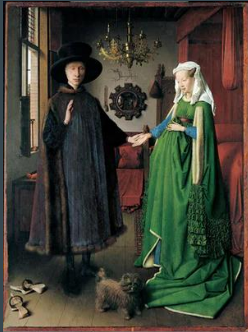
Jan Van Eyck's "Arnolfini Wedding"