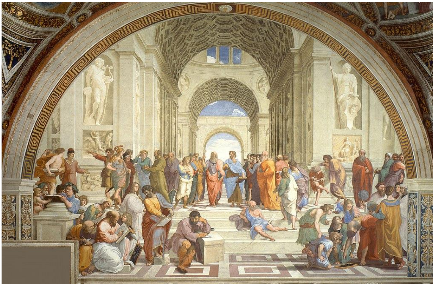
Raphael's "School of Athens" (1509-1511)