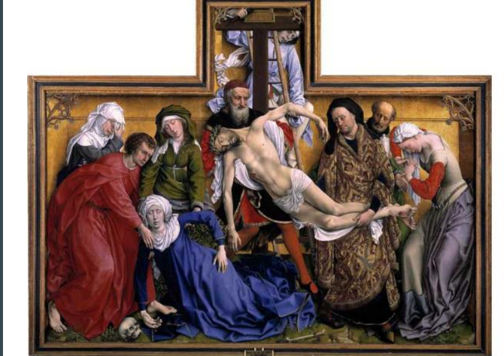
ROGIER VAN DER WEYDEN The Deposition (c.1435)

How can you describe this as “Northern Renaissance”?