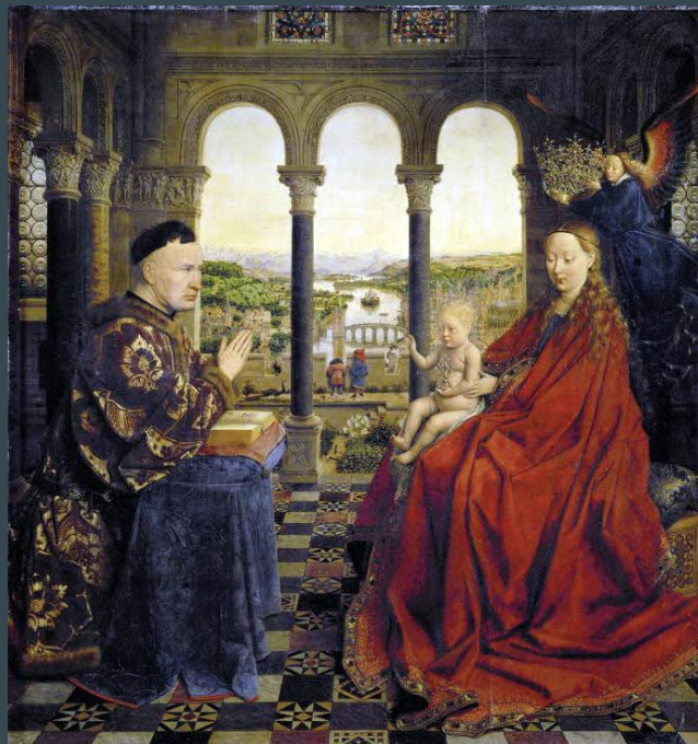
Jan van Eyck's "Madonna and Chancellor Rolin"