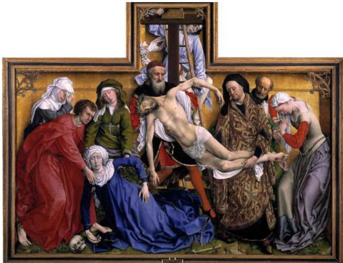
ROGIER VAN DER WEYDEN