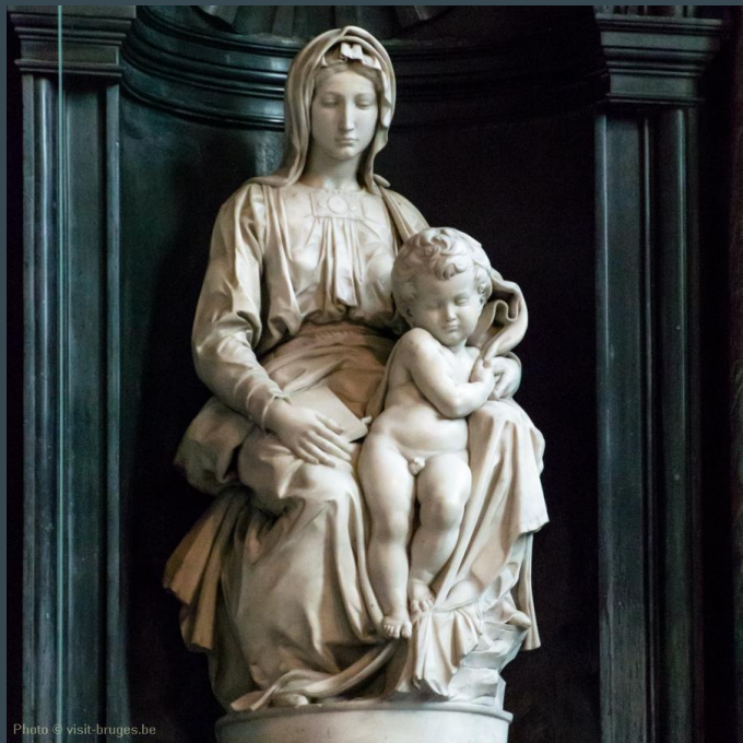
Michelangelo's "Madonna of Bruges"