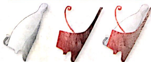
crown of Upper Egypt

The rock shows a figure carrying a staff. Near the head of the figure is a scorpion. Another artifact, a macehead, also shows a king with the scorpion symbol. Both artifacts suggest that Egyptian history may go back to around 3250 B.C. Some scholars believe the Scorpion is the earliest king to begin unification of Egypt, represented by the double crown shown below.