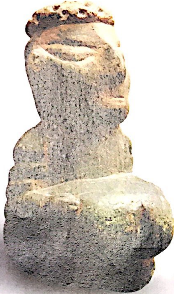
▼ A 9,000-year-old baked-clay figurine found in Catal Huyuk

Catal Huyuk showed the benefits of settled life. Its rich, well-watered soil produced large crops of wheat, barley, and peas. Villagers also raised sheep and cattle. Catal Huyuk’s agricultural surpluses supported a number of highly skilled workers, such as potters and weavers. But the village was best known at the time for its obsidian products. This dark volcanic rock, which looks like glass, was plentiful. It was used to make mirrors, jewelry, and knives for trade.